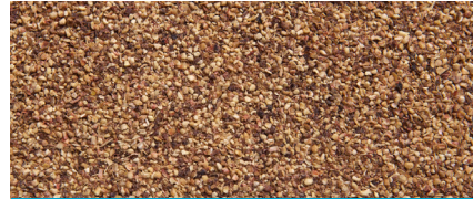
1/8" Cob Bedding

Packaging: 390 Cubic Inch bags 4 Bags/Case, 35 cases/pallet MOQ: 1 Pallet