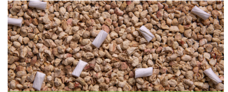
Corn Cob + Nesting Twists