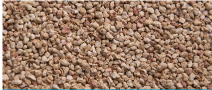
1/4" Cob Bedding